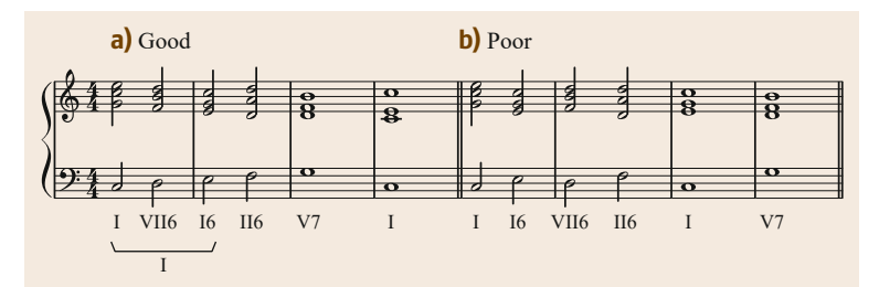
Fig. 25.1a,b The contrast between a good (a) and a poor (b) harmonic progression as discussed by Aldwell and Schachter [25.8, p. 140]. (b) is poor because the dependencies between the chords are disrupted – for instance, the II6 chord is not functionally well connected to its context (even though it features good voice-leading). Further note that in the analysis of the good example, the authors propose a hierarchical analysis of I VII6 I6 as a prolongation of a single I harmony